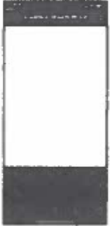
Covid Test Result 2.PNG 846K